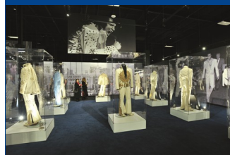
A Collection of Elvis' Outfits