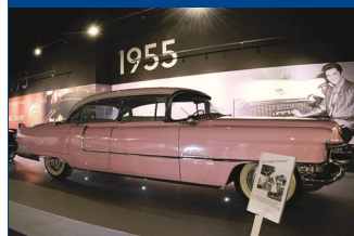
See the Iconic Pink Cadillac