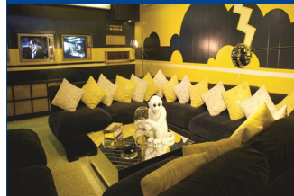
One of many Graceland's Themed Rooms