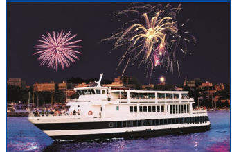
Dinner Cruise on beautiful Lake Champlain