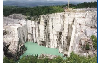
Rock of Ages Granite Quarry

Day 7: Today after enjoying a Continental Breakfast, you depart for home... A perfect time to chat with your friends about all the fun things you've done, the great sights you've seen and where your next group trip will take you!