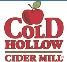
Cold Hollow Cider Mill