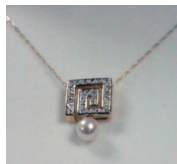
14K Gold Necklace with diamond & pearl pendant